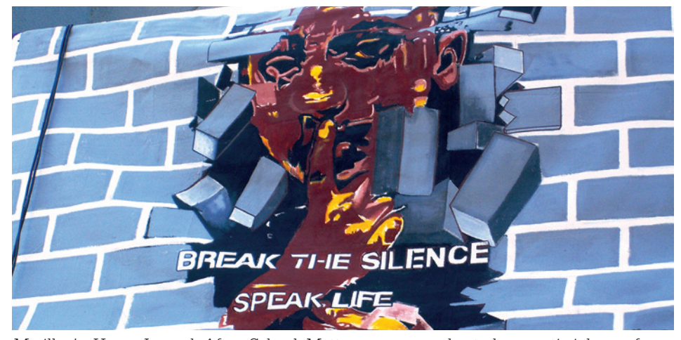
Marillac's Hope Jr. and After School Matters programs hosted an anti-violence forum featuring artistic collaborations from teen groups to speak out against violence. Children and teens from five West Side After School Matters groups, as well as staff and other performers, treated the audience to performances focused on finding their voices.

We are so proud of the amazing feats that our staff accomplishes each day and the wonderful examples they continue to set for our clients.